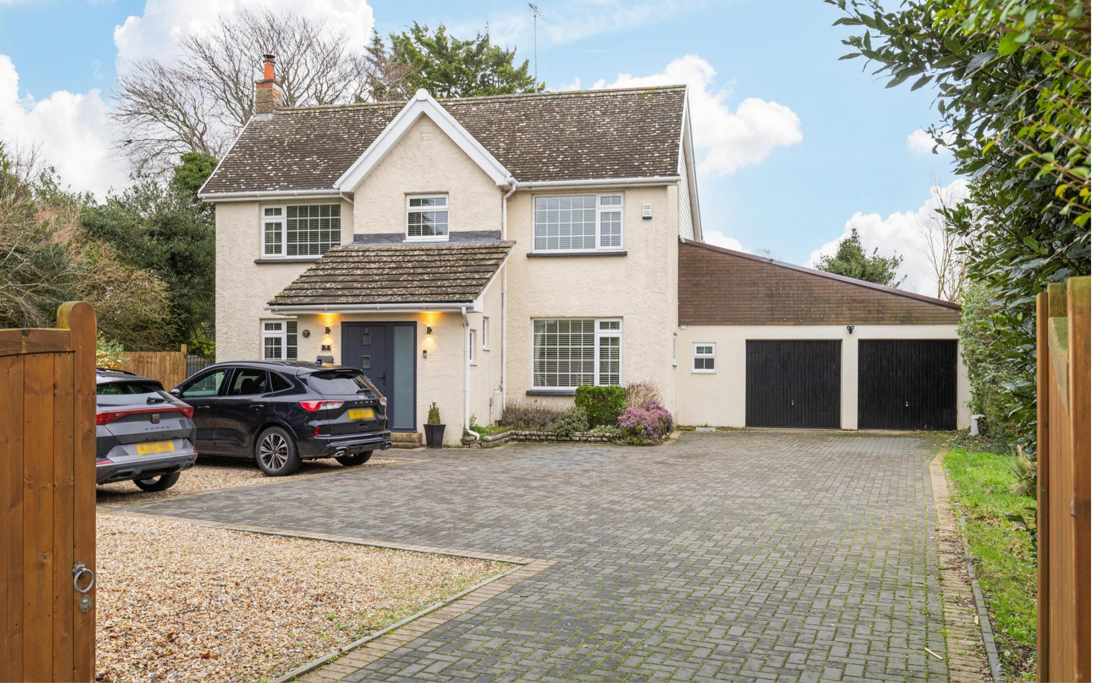
Holly House, Clarence Road Dorchester